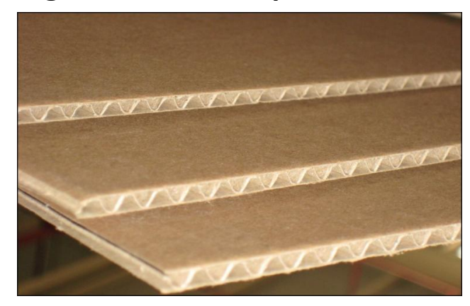
Impact: reduced container weight & cost